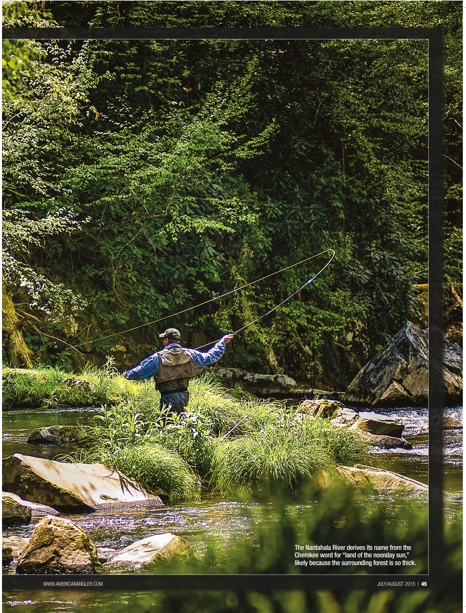
The Nantahala River derives its name from the Cherokee word for "land of the noonday sun," likely because the surrounding forest is so thick.