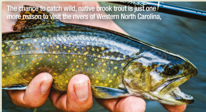
The chance to catch wild, native brook trout is just one more reason to visit the rivers of Western North Carolina.

One sure way to increase your odds on this river is to change patterns often. If you haven't gotten a bite on the Natty in 10 minutes, change flies and keep changing until you find what the fish want. Once you find the right pattern, be ready to set the hook quickly. Finally, although the "tube hatch" is aggravating at times, it subsides almost completely after Labor Day and won't start in earnest again until the middle of the following May, so anglers can have the run of the river during the shoulders of the season.