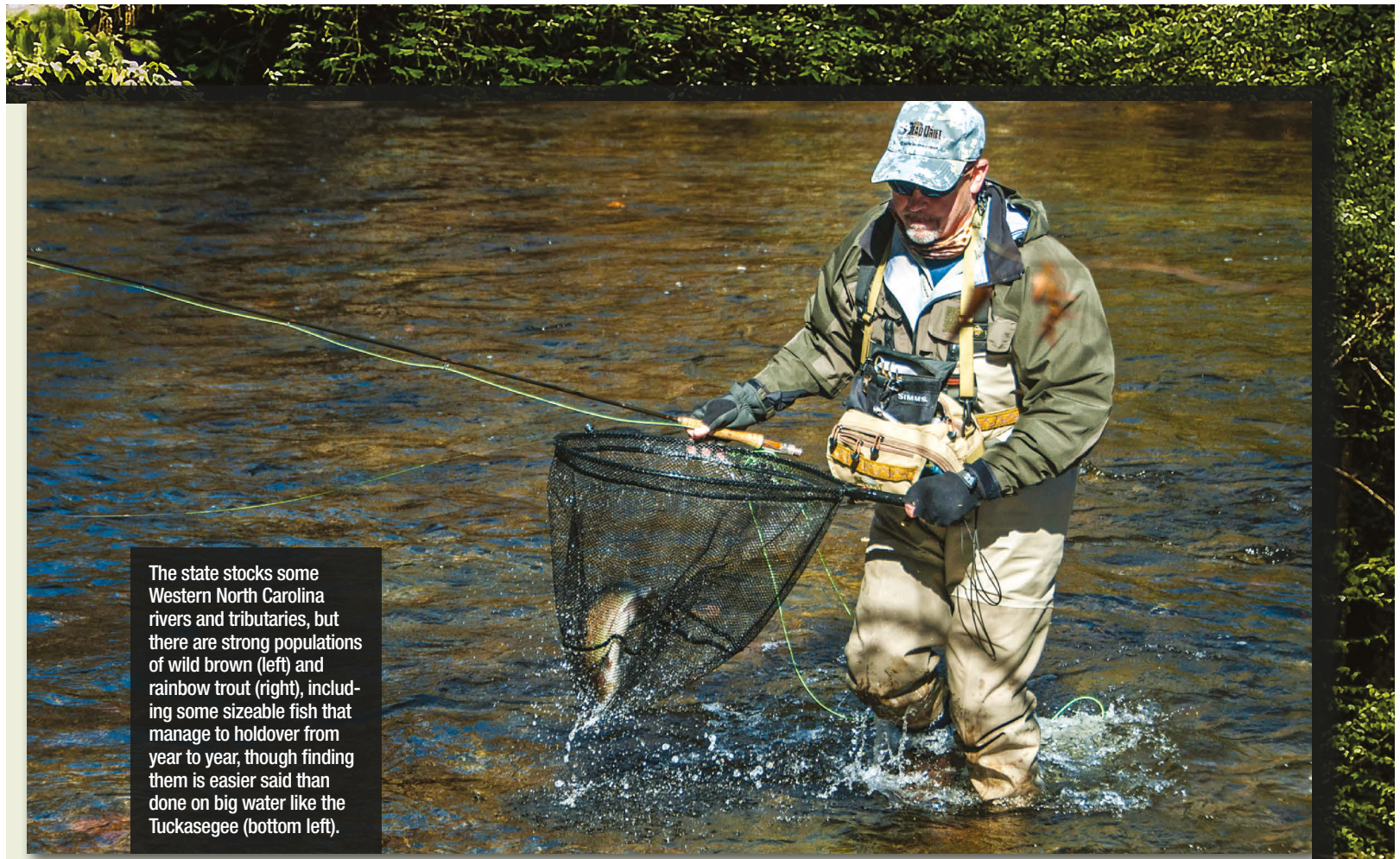
The state stocks some Western North Carolina rivers and tributaries, but there are strong populations of wild brown (left) and rainbow trout (right), including some sizeable fish that manage to holdover from year to year, though finding them is easier said than done on big water like the Tuckasegee (bottom left).

the trout that call it home. Wading is quite easy, and the flow really isn't much of a problem even when the river is running a bit high, but you should still use caution when wading here just as you would in any other river.